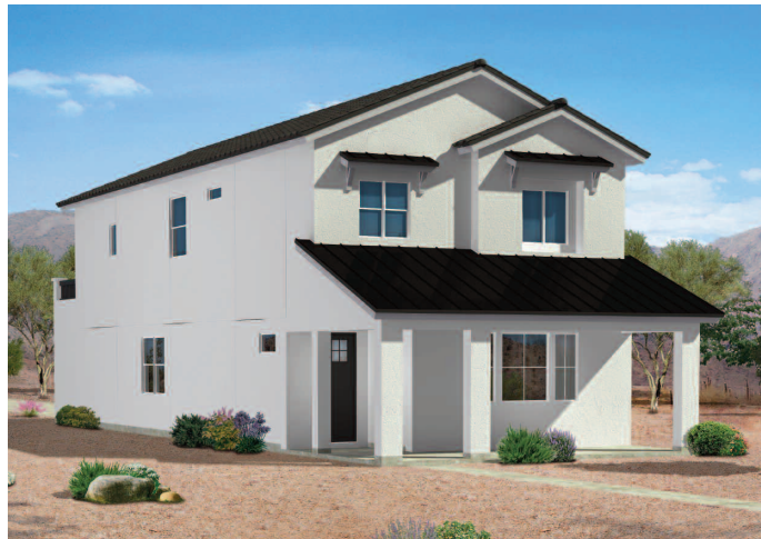
DESERT TERRITORIAL ELEVATION