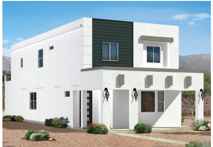
DESERT MODERN ELEVATION