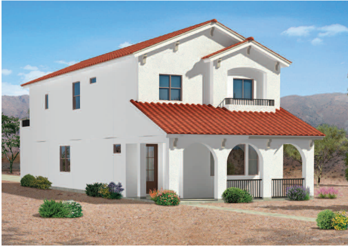
SPANISH MISSION ELEVATION