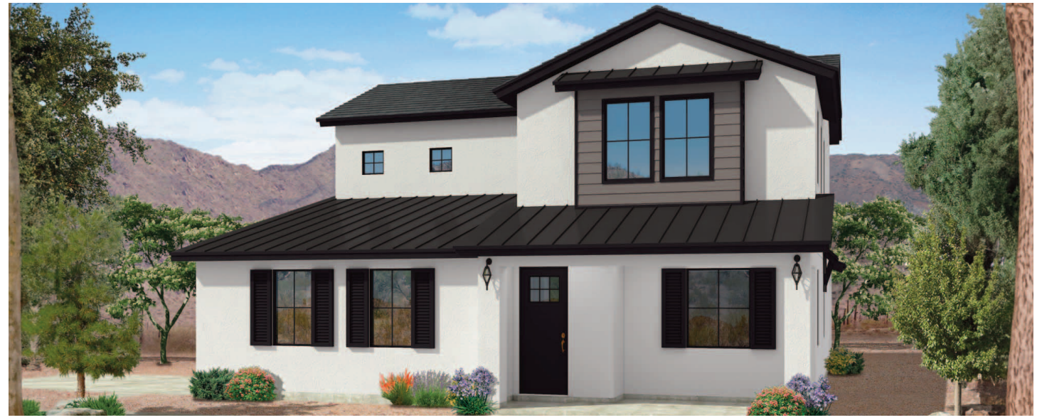
DESERT TERRITORIAL ELEVATION